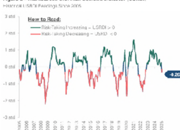
Figure 2 – MarketDesk U.S. Risk Demand Indicator (USRDI)

As of 3/14/2025.