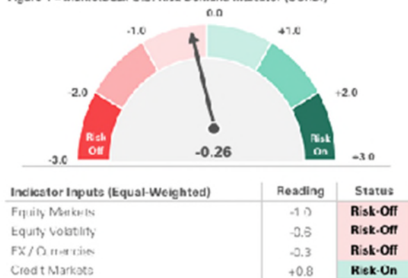
Figure 1 – MarketDesk U.S. Risk Demand Indicator (USRDI)

Source: MarketDesk Quant Pack. As of 3/14/2025.